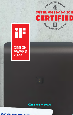
CMX5 Reader with Keypad